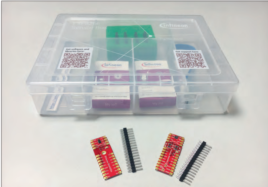
Figure 4. Based on an Arduino shield, a monitoring/sensor box supplies the data needed for predictive maintenance.

On the basis of the 3D resolution and using special algorithms, it is possible to anticipate the directions of movement, for example. The prototype of a robot, which recognises its surroundings with ToF 3D cameras, and which in future will be able to anticipate directions of movement, has already been successfully tested at the Infineon production facility in Dresden. A redundant, sensor fusion-based extension to 24 or 60 GHz radar systems is in preparation.