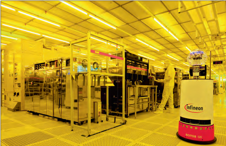
Figure 2. At Infineon's Dresden production facility, a robot is used which can also anticipate directions of movement. It works with ToF 3D cameras, and will make use of a redundant 24 or 60 GHz radar system.

is a design that is as compact as possible, in particular a space-saving and efficient motor control unit. This is made possible by IGBTs or low-resistance MOSFETs (e.g. OptiMOS), highly integrated gate drivers with built-in protection and integrated power modules, so called IPMs that combine the complete power control infrastructure within a single package. Advanced robot control algorithms rely on highest precision parameter capturing such as torque, position, pressure, etc with corresponding sensors. Data then needs to be processed with powerful safety controllers such as the AURIX family.